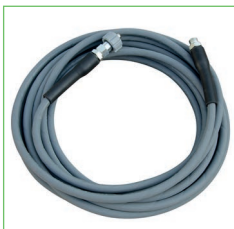
10 m high pressure hose (5/16") code : 1.205.520.020