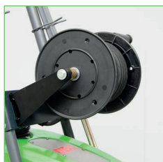
Hose reel set with 20 m hose reel code: 1.205.025

The following special accessories are often requested tools for this type of high pressure cleaners. Please inform us of the desired pressure and flow when placing your order.