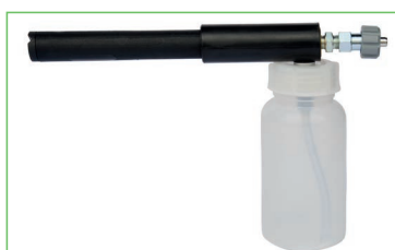
200 mm foam lance with 1 l tank and quick release, suitable for an operating pressure from \leq 250 bar code : 1.244.251