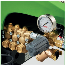
FEWER VIBRATIONS : radial high pressure pump with 3 ceramic plungers