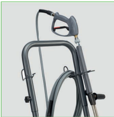
Height adjustable handle