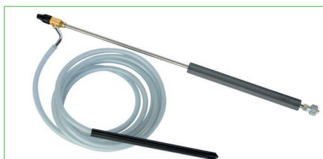
High pressure grit blasting lance with flat jet nozzle and suction hose suitable for an operating pressure from \leq 250 bar Length : 900 mm code : 1.258.220.xxxx