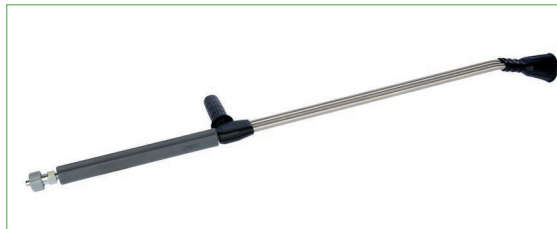
Double stainless steel spray lance with low and high pressure nozzle and rotating quick coupling (only on < 320 bar and < 41 l/min) code : 1.208.630.xxxxx