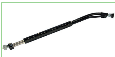
Flexible spray lance with high pressure nozzle, length : 850 mm, operating pressure \leq 200 bar code : 1.208.828.xxxx