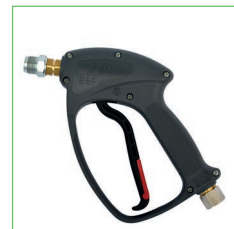
High pressure gun with swivel code : 1.211.525