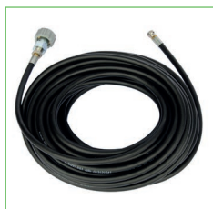
Sewer hoses with nozzle and rotating quick coupling from 10 m up to 25 m, suitable for operating pressures \leq 200 bar code : 1.238.520.xxxx