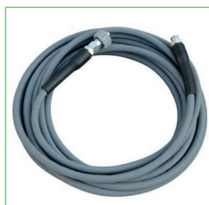
High pressure extension hoses with quick release from 10 m up to 25 m, suitable for operating pressures \leq 250 bar code : 1.205.520.xxxx