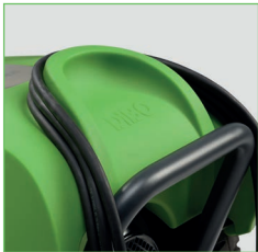
Easy storage of electric cable